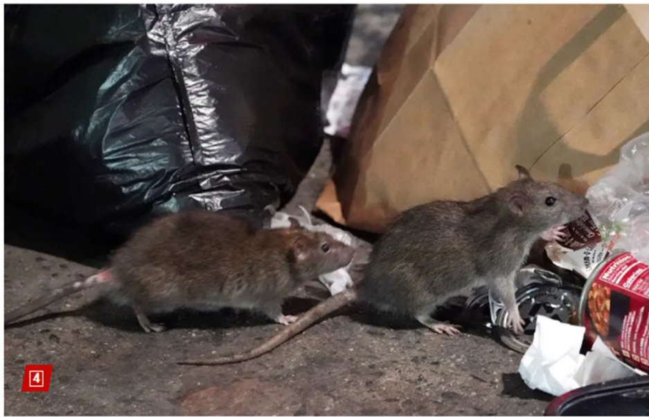
City Hall and New York’s major building staff union have struck a deal that officials hope will help combat the Big Apple’s rat epidemic.